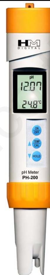
PH-200 pH / TEMP METER